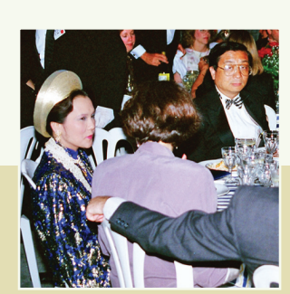
Presidential Banquet Washington, DC, USA (1993)