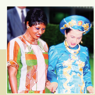
First Lady Henriette Bedié Côte d'Ivoire (1996)