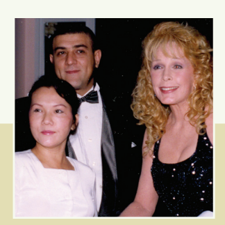
Stella Stevens Golden Globe-winning American actress Night of 100 Stars Oscar benefit gala in Beverly Hills, California USA (1999)