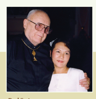
Rod Steiger Oscar Award-winning American actor Night of 100 Stars Oscar benefit gala in Beverly Hills, California USA (1999)