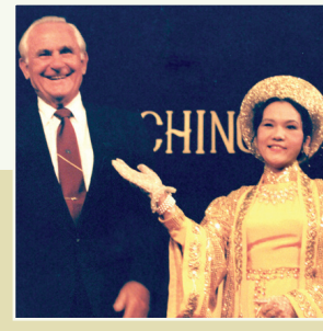
Mayor Frank Fasi proclaimed Oct. 25 as Supreme Master Ching Hai Day in Honolulu, Hawaii, USA (1993)