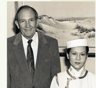
US House of Representative Earl Hutto invited Supreme Master Ching Hai to visit Congress in Washington, DC, USA (1993)