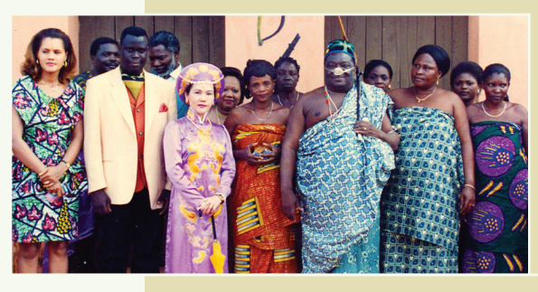
King Agboli-Agbo Dedjlani and the Prince of Benin welcomed Supreme Master Ching Hai in Abomey, Benin (1995)