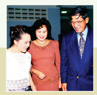
Prime Minister Samdech Hun Sen and wife Bun Ramy Cambodia (1996)