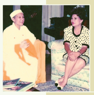
Second Lady Celia Diaz-Laurel Philippines (1992)