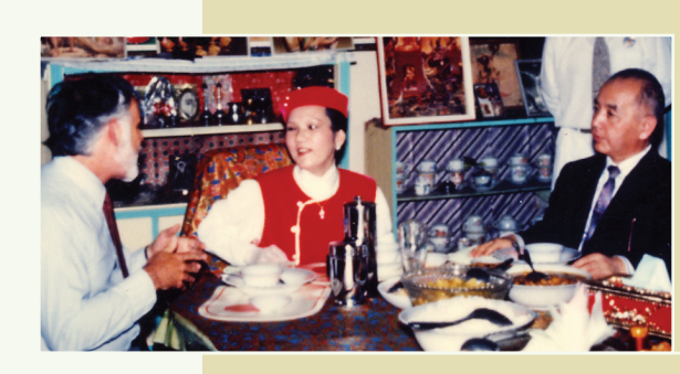
US and Japan Consulates welcomed Supreme Master Ching Hai to Indonesia (1993)