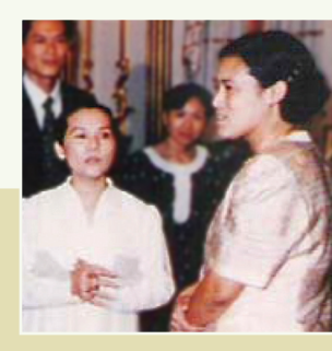
Princess Maha Chakri Sirindhorn Thailand (1994)