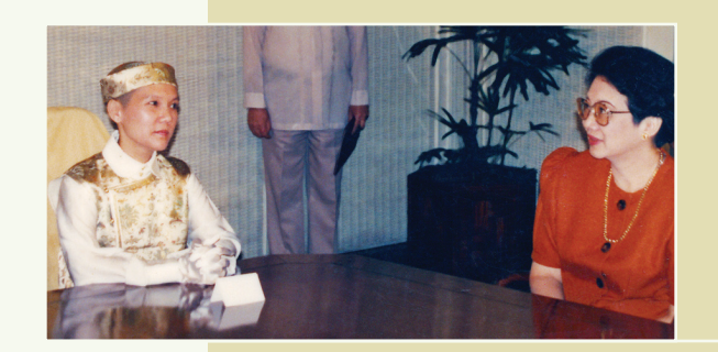
President Corazón Cojuangco-Aquino met with Supreme Master Ching Hai to discuss refugee resettlement in the Philippines (1992)