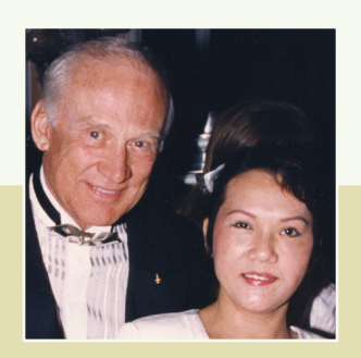
American astronaut Buzz Aldrin Second man to step foot on the moon Night of 100 Stars Oscar benefit gala in Beverly Hills, California USA (1999)