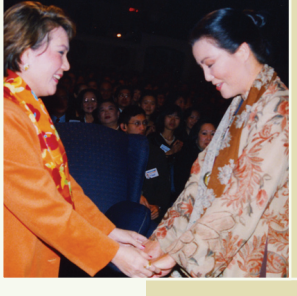
Kiều Chinh Distinguished Aulacese (Vietnamese) actress A Journey through Aesthetic Realms benefit concert in Washington, DC, USA (1997)